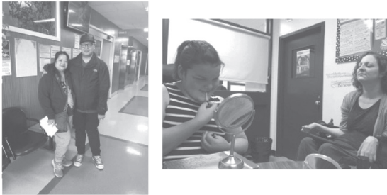
Living Life to the Fullest

Mission: To assist persons with spinal cord injuries and other physical disabilities to achieve independence, self-reliance, and full community participation